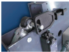
Maximum safety system against obstacles