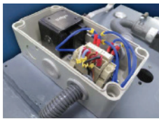
Electrical control of locking system