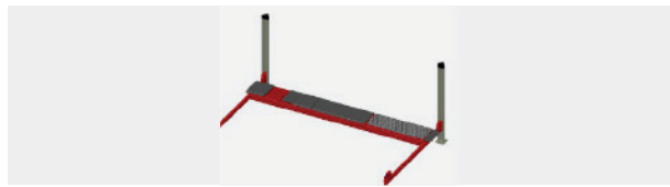
Alignment platforms equipped with sliding rear platforms and adjustable recesses for front turning plates