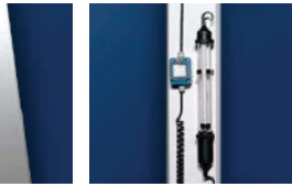
Inspection lighting equipment 24v