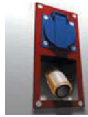
Air & energy supply