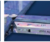
Scissor jacking beam